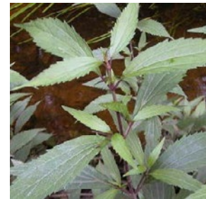
Mist Flower: Flower and Leaves