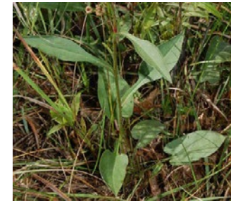
Sky Blue Aster: Flower and Leaves