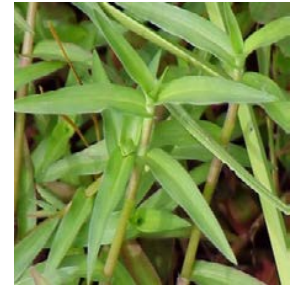
Spiderwort: Flower and Leaves