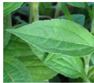
Black Eyed Susan: Flower and Leaves