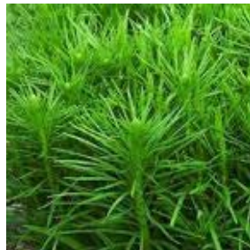
Dwarf Blazing Star: Flower and Leaves