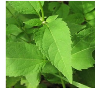
Pale Leaved Sunflower: Flower and Leaves