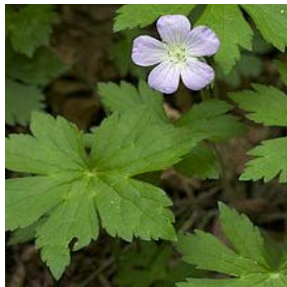
Wild Geranium: Flower and Leaves