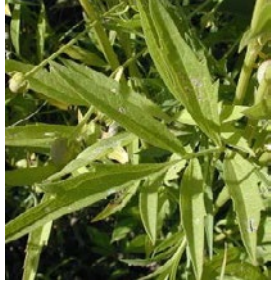
Yellow Coneflower: Flower and Leaves