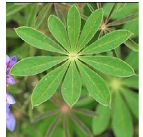
Wild Lupine: Flower and Leaves