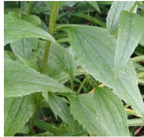
Purple Coneflower: Flower and Leaves