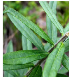
Butterfly Weed: Flower and Leaves