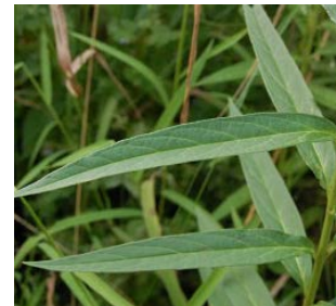
Marsh Red Milkweed: Flower and Leaves