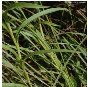
Riddell's Goldenrod: Flower and Leaves