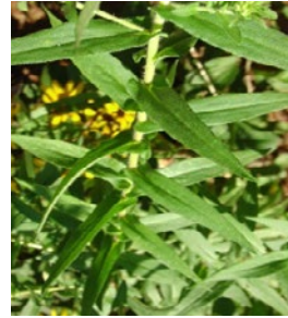
New England Aster: Flower and Leaves