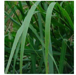
Switch Grass: Full-Grown Plant and Leaves