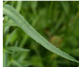
Sneezeweed: Flower and Leaves