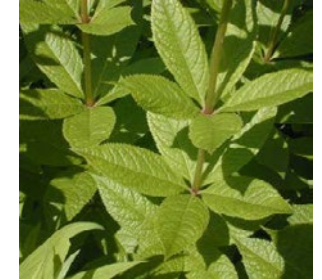
Culver's Root: Flower and Leaves