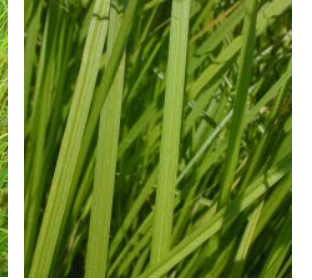
Fox Sedge: Full-Grown Plant and Leaves