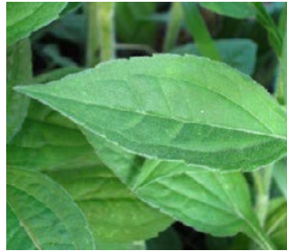
Black Eyed Susan: Flower and Leaves