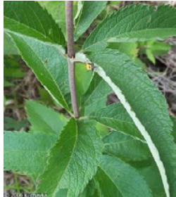
Spotted Joe Pye Weed: Flower and Leaves