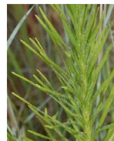
Prairie Blazing Star: Flower and Leaves