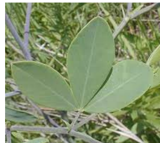
Cream Wild Indigo: Flower and Leaves