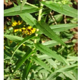
New England Aster: Flower and Leaves