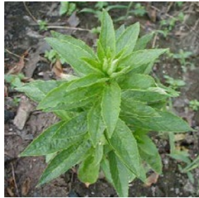
Great Blue Lobelia: Flower and Leaves