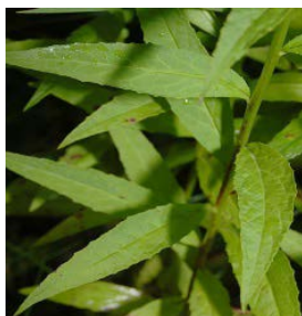
Cardinal Flower: Flower and Leaves