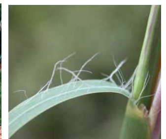
Little Bluestem: Full-Grown Plant and Leaves