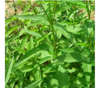
Blue Vervain: Flower and Leaves