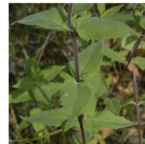
Wild Bergamot: Flower and Leaves