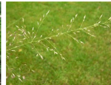
Prairie Dropseed: Full-Grown Plant and Leaves