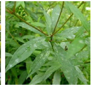
False Aster: Flower and Leaves