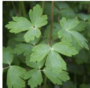
Wild Columbine: Flower and Leaves